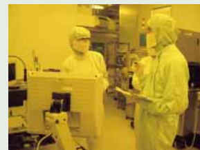
An audit in the clean room