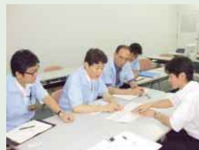
An audit of documents