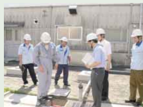
An outdoor worksite audit