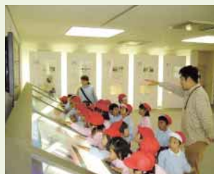
Preschoolers tour the NEC Fukui factory

NEC Fukui has built a biotope in its factory grounds. In October 2005, children from a nursery school nearby were invited to participate in a nature outing and learn about the creatures that inhabit the biotope. The children also enjoyed the chance to scoop medaka (Japanese rice fish) out of the pond, hunt for dragonfly larvae, and collect insects.