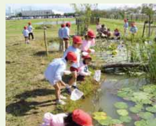
The nature outing